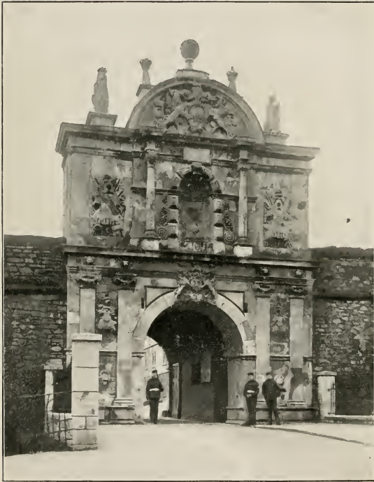
THE GATEWAY OF THE CITADEL OF PLYMOUTH WHICH IT IS PROPOSED TO CONVERT INTO A UNIVERSITY